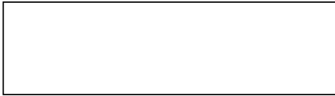
Applicant 's Signature