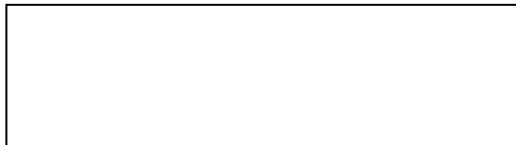
Applicant 's Signature

The photograph and signature of _____ are attested below:-