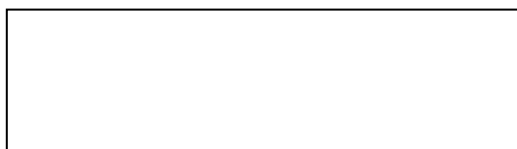
Applicant 's Signature

The photograph and signature of _____ are attested below:-